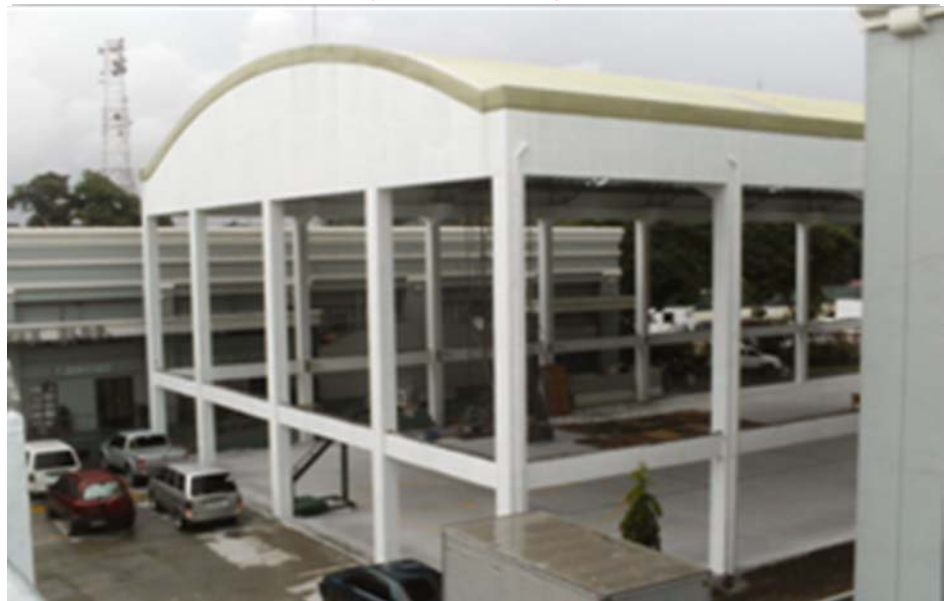
COMPLETED COVERED COURT AT PDEA COMPOUND LOCATED AT NORTHSIDE ROAD, BRGY. PINYAHAN, QUEZON CITY