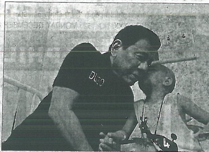
A cancer-stricken child kisses President Duterte during his visit to the Southern Philippine Medical Center's Children's Cancer and Blood Disease Unit in Davao City on Christmas Eve.