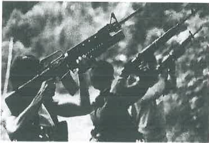
New People's Army.

TACLOBAN CITY, Philippines — A soldier was killed while another was wounded on Saturday afternoon in an ambush by communist rebels in Gamay town, Northern Samar, after delivering vote counting machines (VCM) in another town.