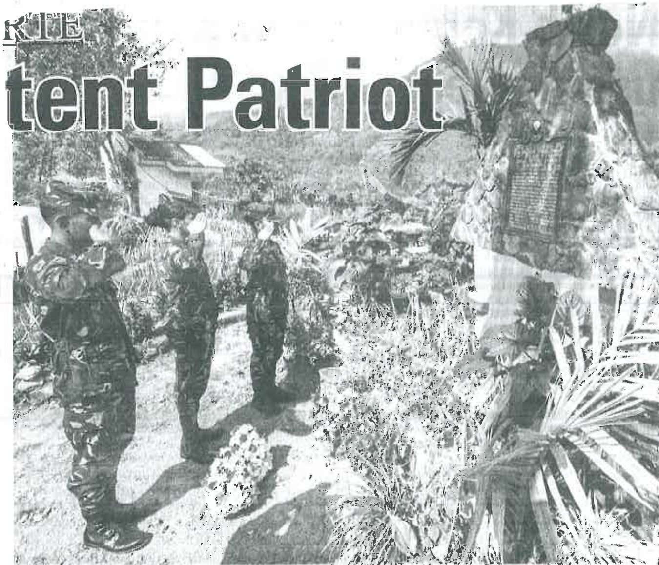
SALUTE TO RICARTE —Soldiers salute the stone marker in Hungduan, Ifugao, dedicated to Gen. Artemio Ricarte, the first commanding general of the Philippine Army, last April 29 in celebration of his patriotism.