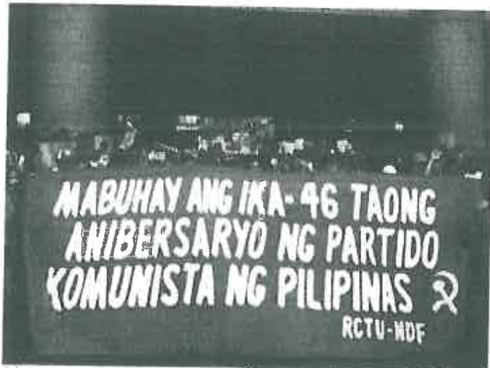
Lightning rally of the National Democratic Front. CONTRIBUTED PHOTO

MANILA - The Communist Party of the Philippines (CPP) on Sunday said it does not participate in the elections of the Philippine government nor does it endorse or support any of the presidential candidates.