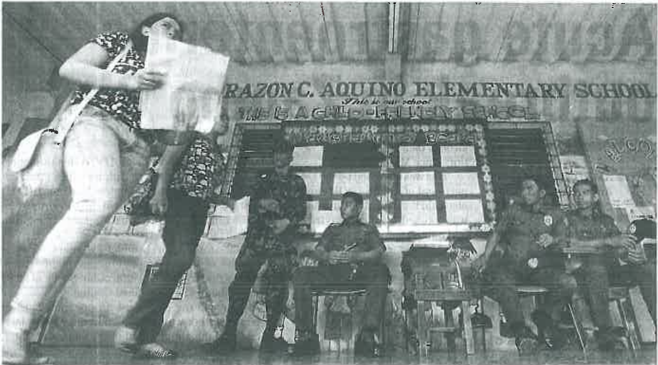
ELECTION SECURITY – Members of the Philippine National Police and Armed Forces of the Philippines are posted inside the Corazon C. Aquino Elementary School in Quezon City yesterday, a major polling center in preparation for today's elections.