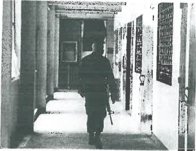
An armed Filipino trooper walks through a polling center in suburban Quezon city, north of Manila, Philippines on the eve of election day Sunday, May 8, 2016.

Agence France-Presse 05:26 PM May 8th, 2016