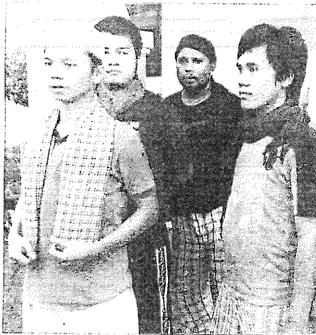
Photo provided by the office of the Sulu governor shows the four Indonesians in Jolo after they were released by the Abu Sayyaf yesterday. The bandit group had earlier freed 10 other Indonesians seized from a tugboat near the Malaysian border.