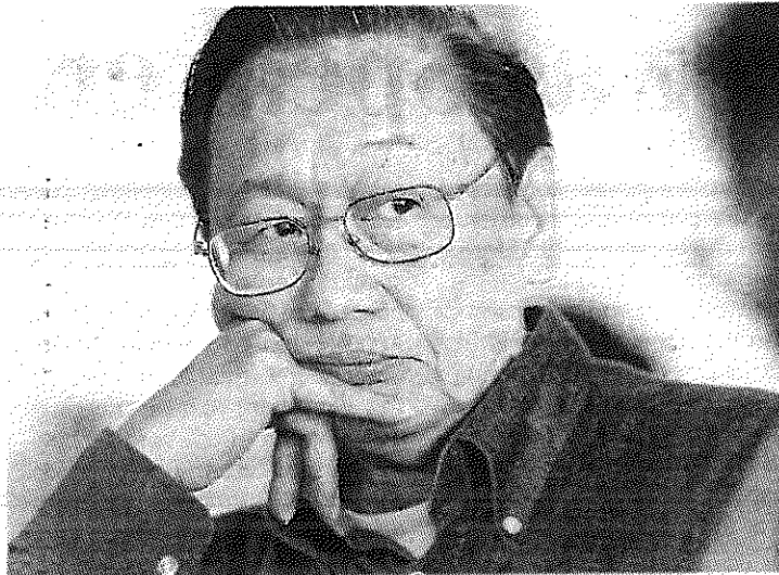
RENDEZVOUS IN EUROPE Jose Maria Sison, Communist Party of the Philippines founder, hopes to meet presumptive President Rodrigo Duterte in Europe before the latter assumes office in Malacañang.