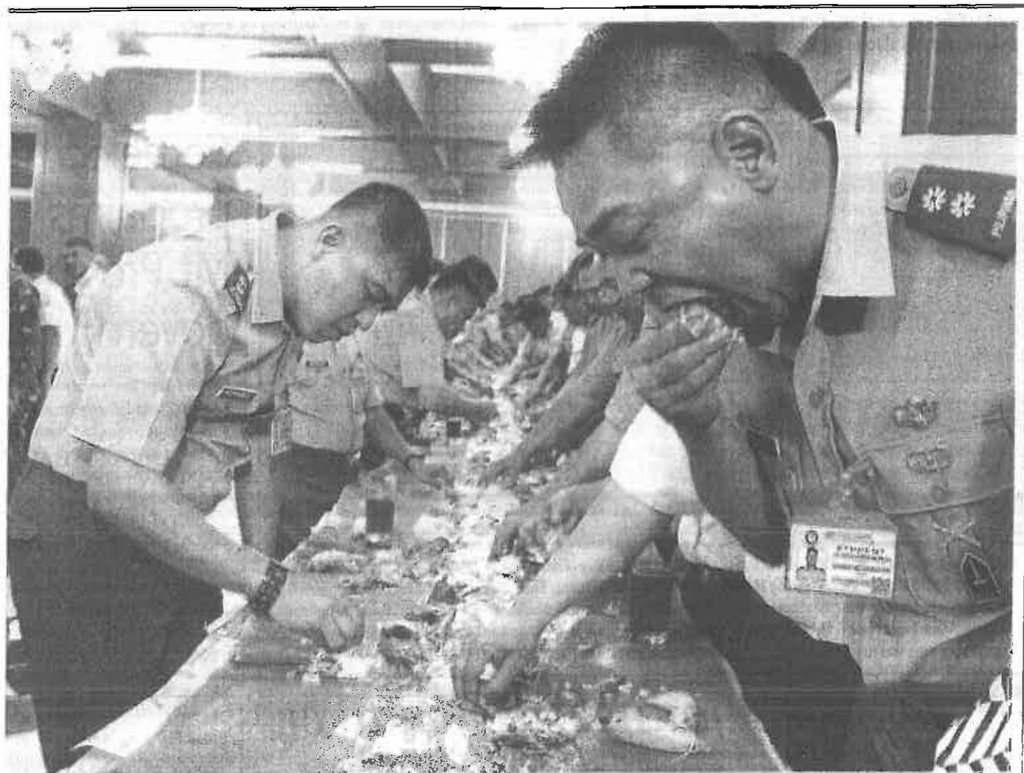
HIGH SPIRITS Philippine Army servicemen and non uniformed personnel join in a boodle fight at Camp Aguinaldo to celebrate the peaceful and orderly elections last Monday.