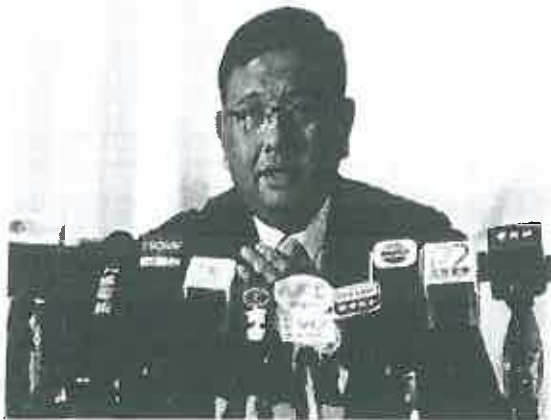
Foreign Affairs Secretary Jose Rene Almendras.

MANILA — Foreign Secretary Jose Almendras said on Wednesday the close coordination between the Armed Forces of the Philippines and Indonesia helped facilitate the release of the four remaining Indonesian hostages by the Abu Sayyaf.