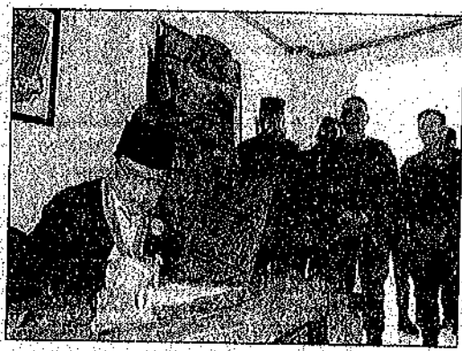
Hadji Murad Ebrahim of the Moro Islamic Liberation Front signs the guest registry of the Army's 6th Infantry Division during his first ever visit to Camp Siongco in Maguindanao yesterday.

The MILF has more than 30 government-recognized