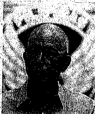
Defense Secretary Delfin Lorenzana

He said the military already has its Civilian Armed Forces Geographical Unit (Cafgu) and Special Cafgu, who are civilians armed by the Armed Forces of the Philippines (AFP).