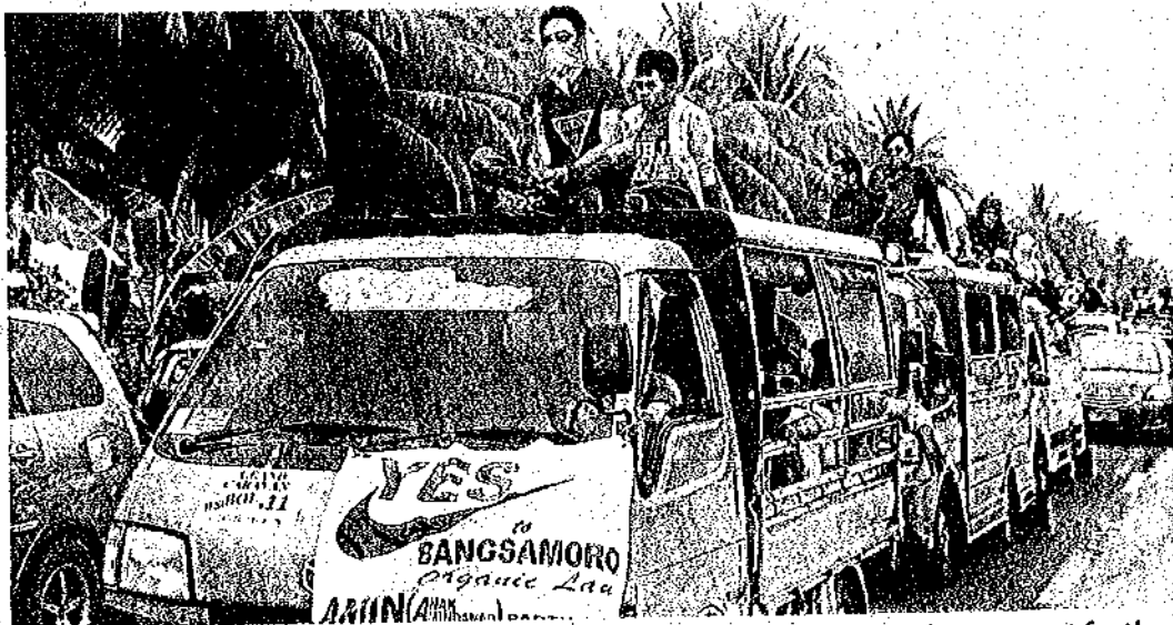
RALLYING SUPPORT Residents in Maguindanao province join a caravan to show support for the ratification of the Bangsamoro Organic Law.

On Andaya's statement that Diokno had wasted efforts of the administration to gain last-