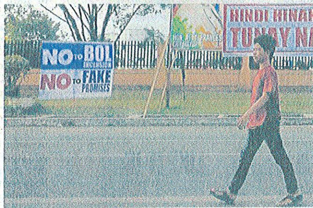
SAYING NO Streamers opposing the Bangsamoro Organic Law are seen in Cotabato City, where voters twice rejected their inclusion in the autonomous region in Muslim Mindanao.