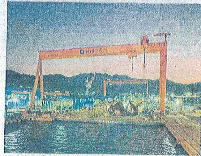
PAST LIFE The Hanjin shipbuilding facility during its heyday.