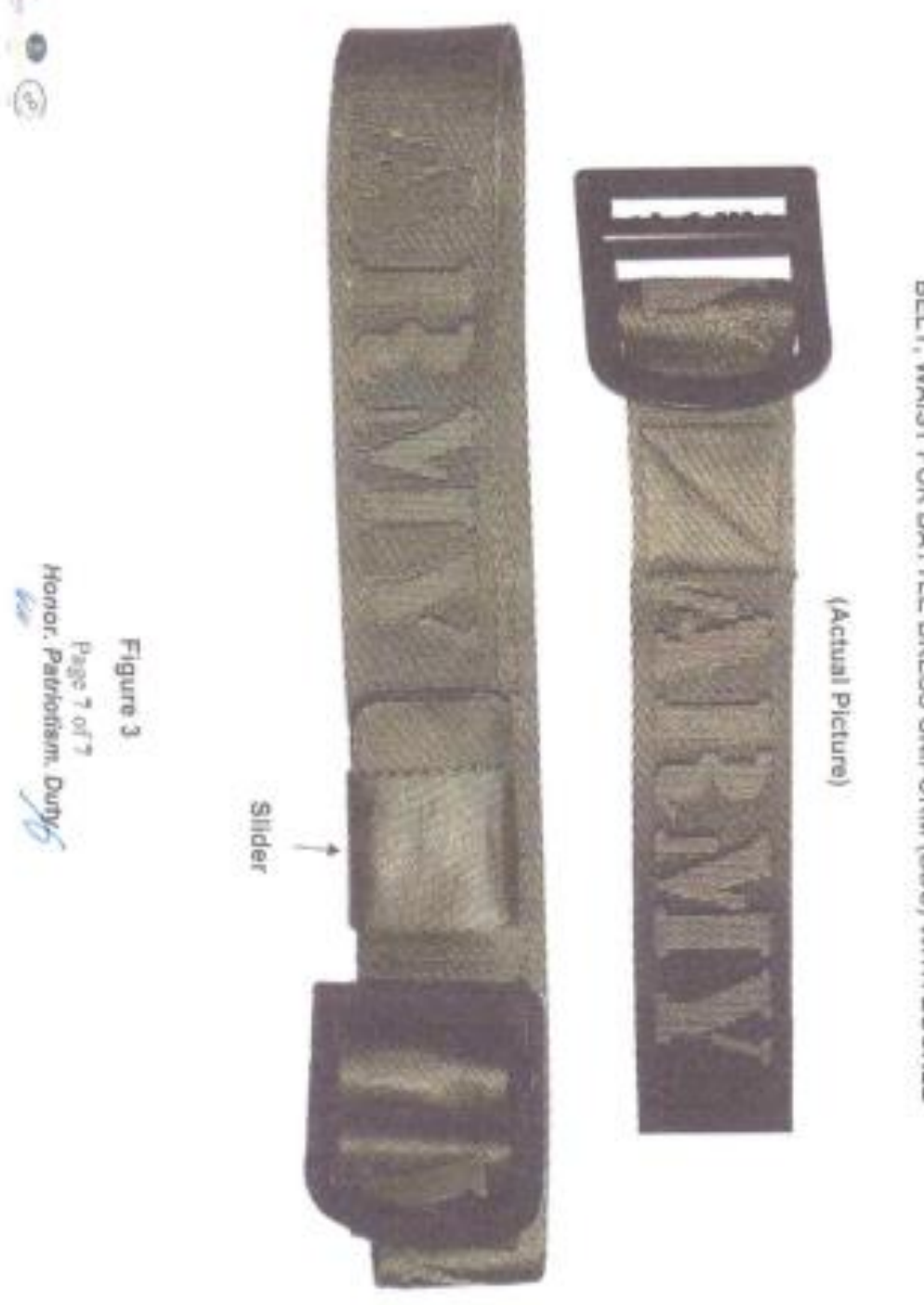
BELT, WAIST FOR BATTLE DRESS UNIFORM (BDU) WITH BUCKLE