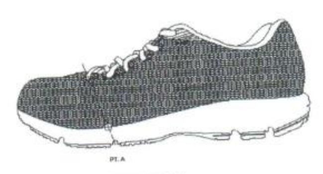
NOTE : PICTURE OR DRAWING WAY VARY BASED ON ACTUAL DESIGN