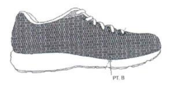
NOTE: PICTURE OR DRAWING MAY VARY BASED ON ACTUAL DESIGN