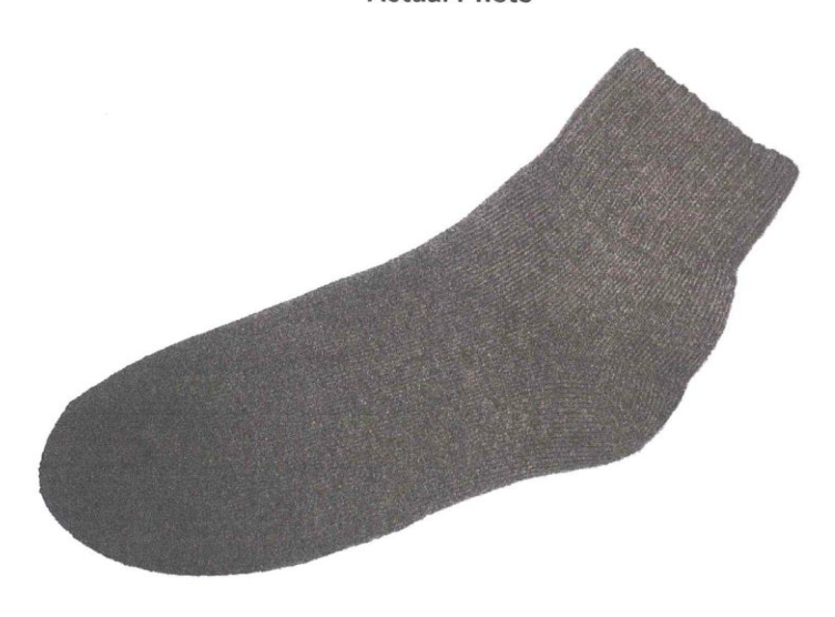
Page 5 of 5 Honor. Patriotism. Puty.