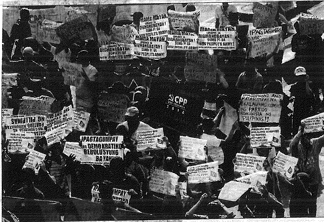
Members of the Communist Party of the Philippines-Metro Manila march along Recto Avenue in Manila to celebrate the 2nd CPP Congress and urge the people to join the New People's Army.

OFFICE OF THE ARMY CHIEF PUBLIC AFFAIRS – Email add: oacpa.army2012@gmail.com – Tel no. (02) 845-9555 Local: 5285, 5295