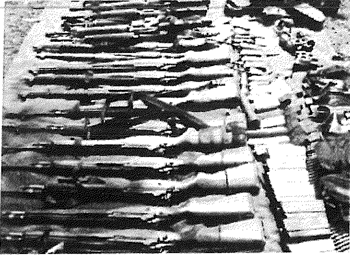
File Photo – firearms in Capual Operations

By Lui Claudio | March 31, 2017 | View Comments