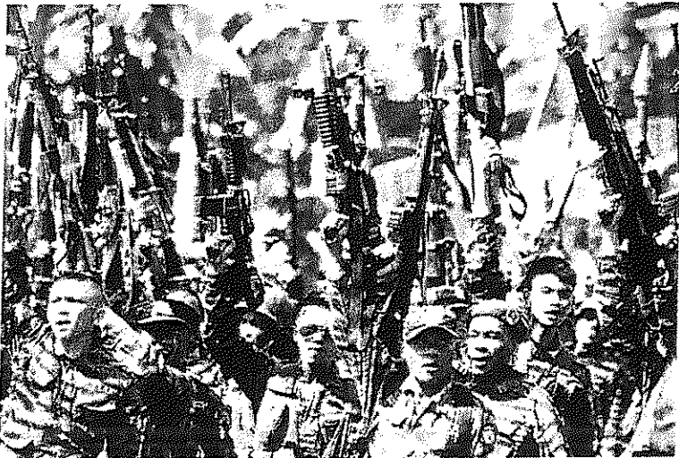
BIFF