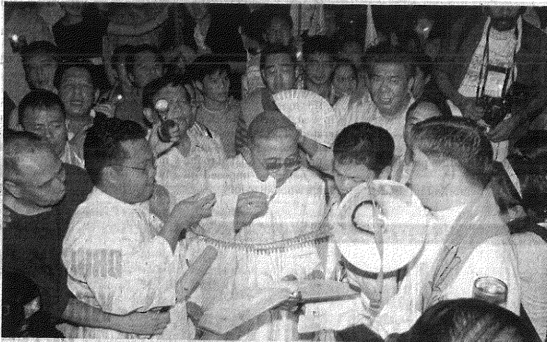
EDSA SHRINE MASS Archbishop Jaime Cardinal Sin (center) and then Msgr. Socrates Villegas (right) celebrate Mass at the Edsa Shrine during the Edsa II People Power Revolution after the impeachment trial of then President Joseph Estrada in 2001. The majority of senator judges had just voted not to open a second envelope containing the bank accounts of Jose Velarde.

OFFICE OF THE ARMY CHIEF PUBLIC AFFAIRS – Email add: oacpa.army2012@gmail.com – Tel no. (02) 845-9555 Local: 5285, 5295