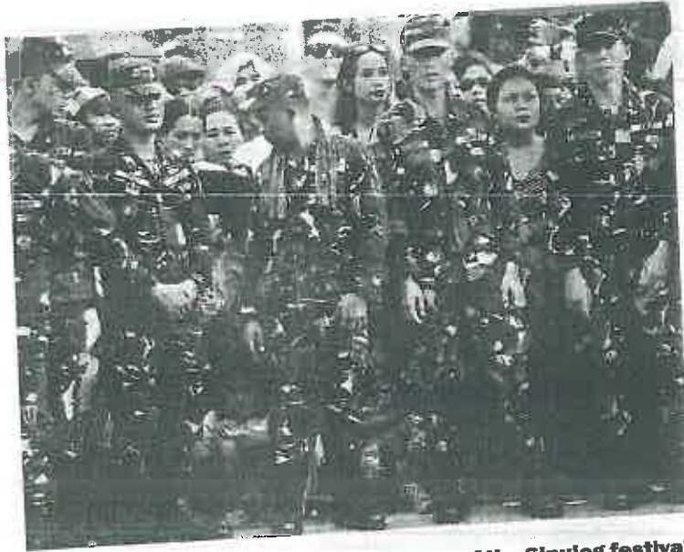
SECURITY FORCE – Soldiers line the route of the Sinulog festival parade in Cebu City Sunday. Army troopers were part of the security force deployed during the festivity. (Juan Carlo de Vela)