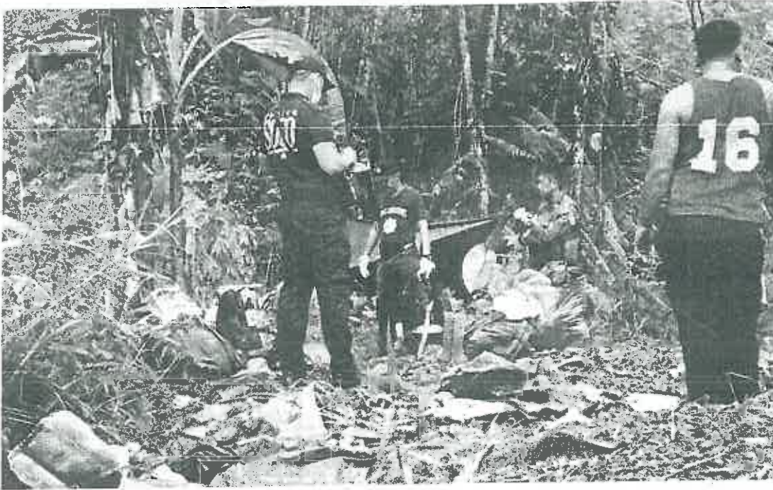
NORTH COTABATO CLASH – Police Investigators go over the scene of the encounter between government troops and guerrillas from the New People's Army in Makilala, North Cotabato, last Thursday. The clash, in which eight soldiers and an insurgent were killed, cast a dark cloud over government negotiations in Rome with the National Democratic Front.