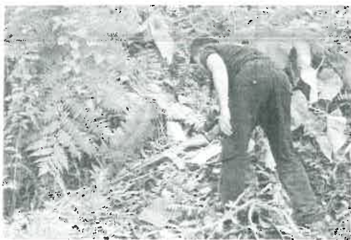
A policeman marks the site where firearms were recovered after a clash in Makilala, North Cotabato.