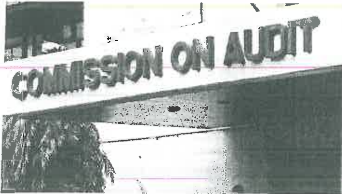
Commission on Audit (INQUIRER FILE PHOTO)

Philippine Daily Inquirer / 01:34 AM January 23, 2017