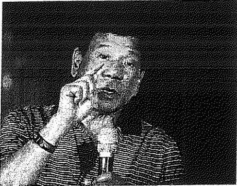
President Rodrigo Duterte.