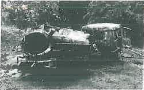
Suspected communist rebels torched a mini tanker truck in Misamis Oriental earlier this month.

Revolutionary taxes imposed by communist rebels in rural areas have led to the closure of operations of several agricultural companies in the countryside, Agriculture Secretary Emmanuel Piñol said Wednesday.