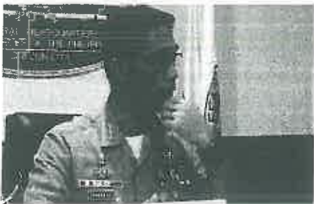
AFP Public Affairs Office (PAO) chief Marine Col. Edgard Arevalo

Nilinaw ngayon ng pamunuan ng Armed Forces of the Philippines (AFP) na walang miyembro ng New Peoples Army (NPA) ang namomonitor sa kalakhang Maynila.