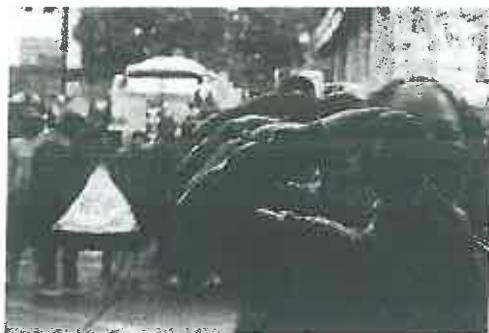
GUERRILLAS IN THE METRO. Communist rebels stage a rally on March 27, 2017, in Quezon City, before their March 29 founding anniversary.

The Communist Party of the Philippines says it has elected young leaders to its central committee as it aims to 'complete victory'