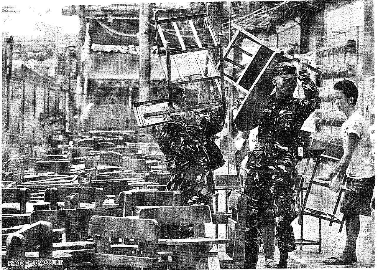
Helping hand. Army reservists lend a hand in the Brigada Eskwela program at the Rosauro Almario Elementary School in Manila.