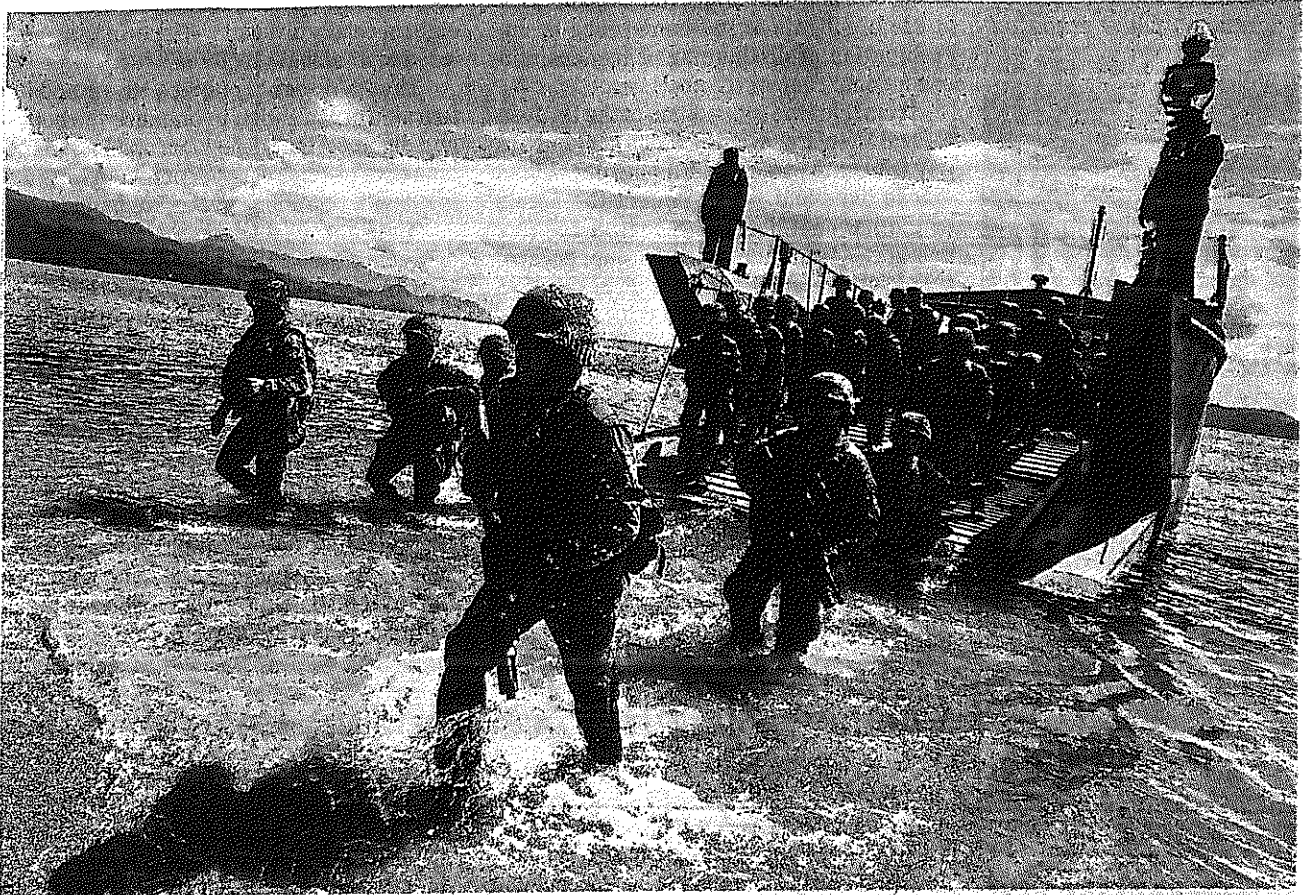
BEACH LANDING – Filipino and American soldiers disembark from an amphibious landing craft on the shores of Casiguran, Aurora as part of the civil-military activities that was held under the 17th Philippines-US Balikatan Exercises. (Alvin Kasiban)