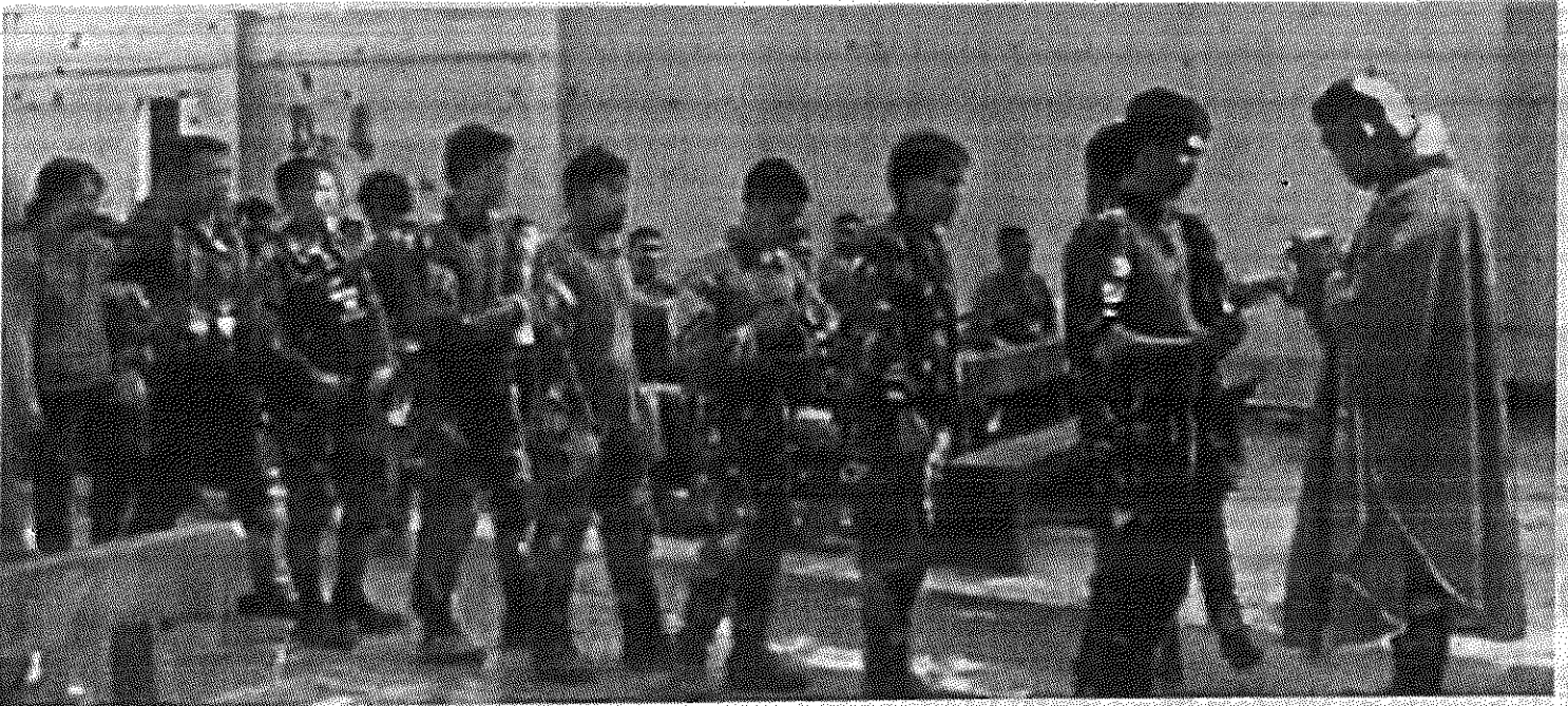
An Army chaplain is shown in this video grab blessing soldiers who heard Mass at the first religious service in St. Mary's Cathedral since war started in Marawi City on May 23.