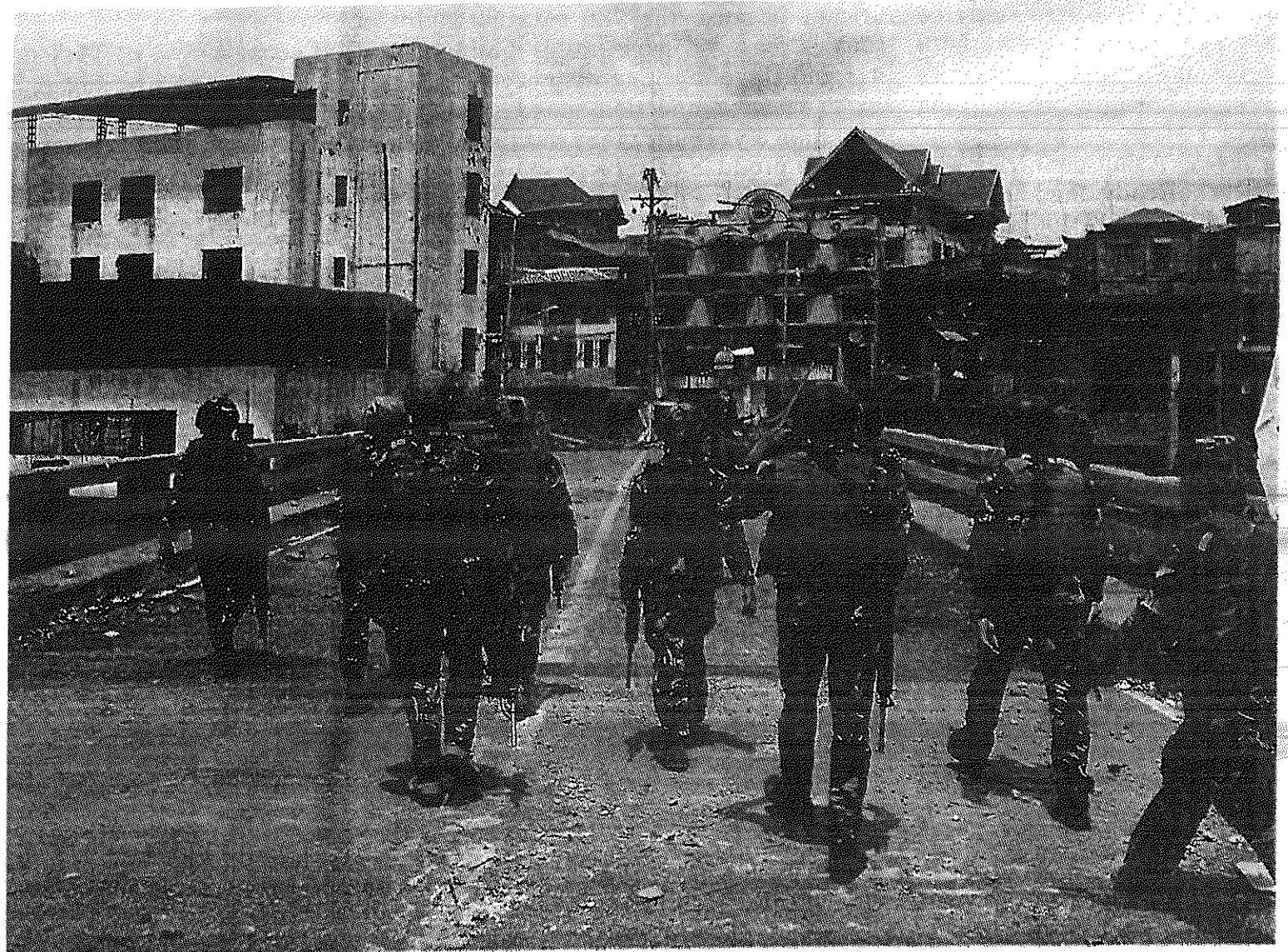
KEN BACK. The commanders of the Joint Task Force Marawi and the Joint Special Operations Task Force Trident crossed the Bayabao and Masui bridges for the first time since the start of the Marawi siege four months ago. Authorities estimate that the number of Maute fighters left in Marawi City has dwindled to less than 50.