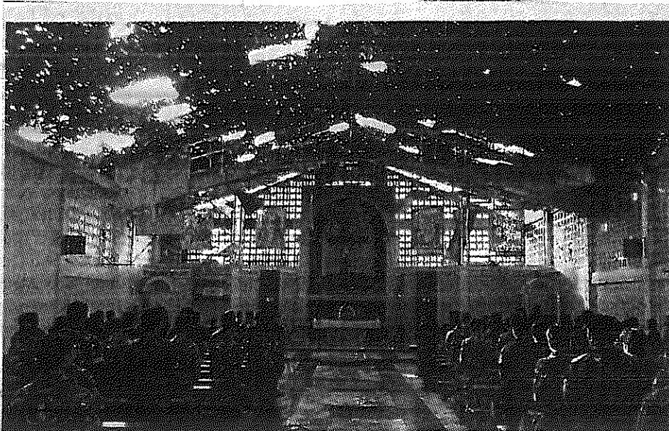
WORSHIP RESUMES Holy Mass is offered for the first time at the badly damaged St. Mary's Cathedral inside the war-torn city of Marawi since fighting broke out on May 23. About 300 government troops battling Maute terrorists assisted in the Eucharist.