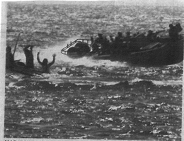
MARITIME SECURITY DOWN SOUTH – Philippine Navy personnel lead a simulated inter-agency capability demonstration drill in the waters off Oslob, Cebu yesterday. Personnel from the Philippine Coast Guard, Central Visayas police, Bureau of Fire Protection and Oslob Disaster Risk Reduction and Management Office likewise took part in the maritime exercises that highlighted their rescue, response and anti-terrorism capabilities.