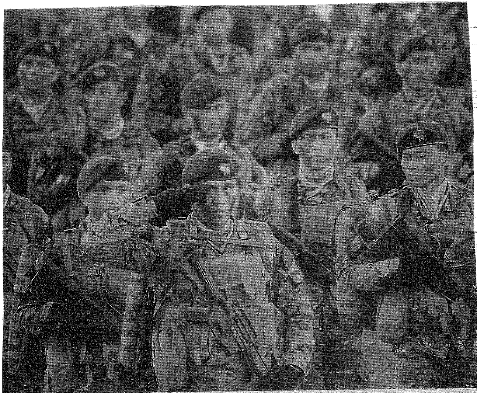
CHANGE OF COMMAND. Philippine soldiers march in formation during the Armed Forces of the Philippines change of command ceremony at the AFP headquarters in Camp Aguinaldo in Manila. AFP