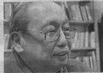
Jose Maria “Joma” Sison

The chief consultant of the National Democratic Front of the Philippines (NDFP) said he would return to the Philippines