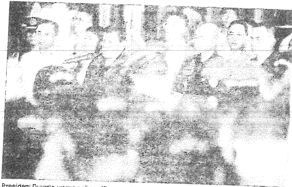
President Duterte warns police officers facing various cases in an expletive-laden speech that the days of scalwags are numbered as he faces them at Malacañang yesterday.

She said NPP board members had made it their commitment to put up a new Noyon Pilipino to remind the Filipinos of the country's culture and diverse heritage.