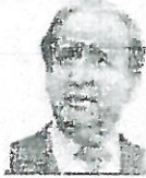
CREATORS SYNDICATE PATRICK J. BUCHANAN

As for the terrorists of ISIS, says Trump, they are defeated.