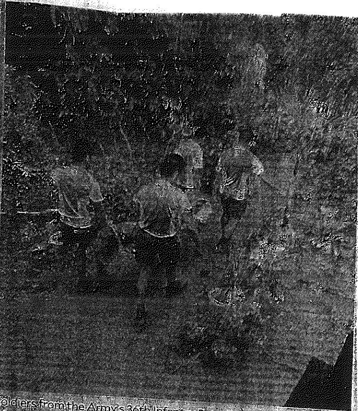
Soldiers from the Army's 36th Infantry Battalion retrieve the body of a farmer who died in a landslide that hit the village of Babuyan in Carrascal town, Surigao del Sur.