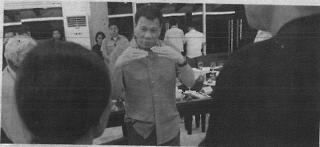
President Duterte engages in a discussion with the two rebel returnees from the New People's Army who were presented to the President at Matina Enclaves in Davao City on Jan. 20.

OFFICE OF THE ARMY CHIEF PUBLIC AFFAIRS – Email add: oacpa.army2012@gmail.com – Tel no. (02) 845-9555 Local: 5285, 5295