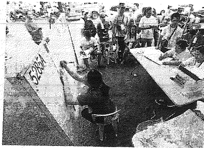
ROADSIDE TALLY Votes are counted manually at one of the roadside precincts in Monday's barangay and Sangguniang Kabataan elections on Boni Serrano Avenue at Barangay Valencia, Quezon City.

and disqualification from holding public office.