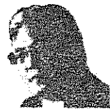
LITO MONICO C. LORENZANA

"If rape is inevitable, you might as well enjoy it." This just about sums up our foreign policy with regard to the West Philippine Sea (WPS). But the inevitable has happened. We are already being raped by China. And our leadership has decided to struggle and complain only half-heartedly. In fact, our leadership has gone out of its way to convince us that: a) we can't