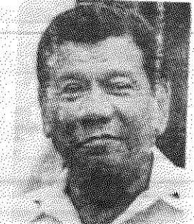
President Duterte national security."

"It can provide a necessary personal complement to carry out the directive of the President to the Bureau of Customs to block the flow of illegal drugs in this country," he said, adding the drug menace "is the number one threat to na-