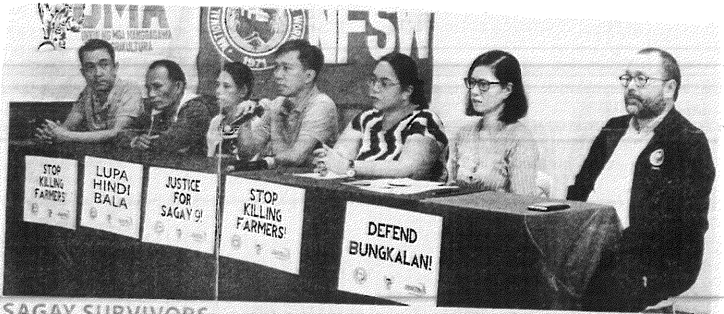
SAGAY SURVIVORS Survivors of the Sagay Massacre in Negros Occidental hold a news conference at the Commission on Human Rights (CHR) office on Wednesday. They and their families refuted allegations of kidnapping against human rights group. Also shown is CHR Chairman Chito Gascon (extreme right).

Oriental, last March after a clash with government troops