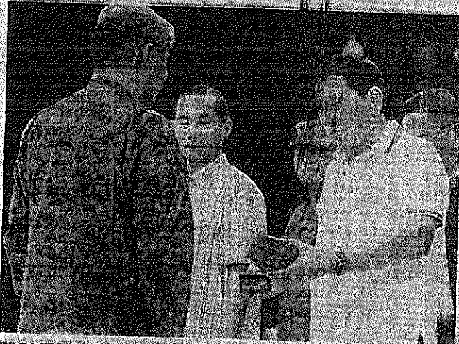
PROMOTED President Duterte leads the donning of ranks of 20 newly promoted military officers at Camp Datu Lipus Makapandong amid military claim of an ouster plot against him.

During the visit, Mr. Duterte led the donning of ranks of 20 newly promoted officers and the awarding of medals, amid