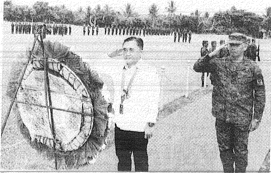
Tribute to heroes Special Assistant to the President Christopher Lawrence "Bong" Go offers a salute after laying a wreath in honor of gallant soldiers during the 14th anniversary celebration of 9th Infantry Division of the Philippine Army in Barangay San Jose in Pili, Camarines Sur.