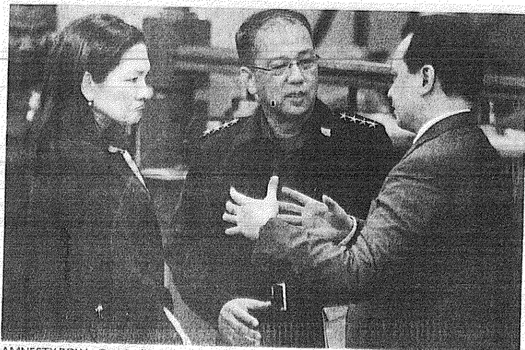
AMNESTY ROW — Gen. Carlito Galvez Jr., the military chief of staff, talks with Senators Antonio Trillanes IV and Risa Hontiveros after a Senate hearing on the defense budget on Tuesday. He testified that Trillanes applied for amnesty in 2011 but that he suspected there had been "lapses" in the handling of amnesty documents that led to the loss of the former military rebel's papers.