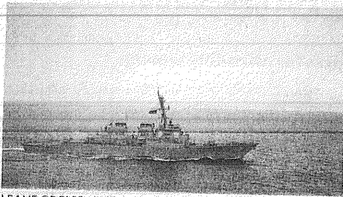
LEAVE OR ELSE Beijing says a Chinese Luyang destroyer gave the USS Decatur (shown in photo) a "warning to leave" because the latter entered the area "without permission." —AP