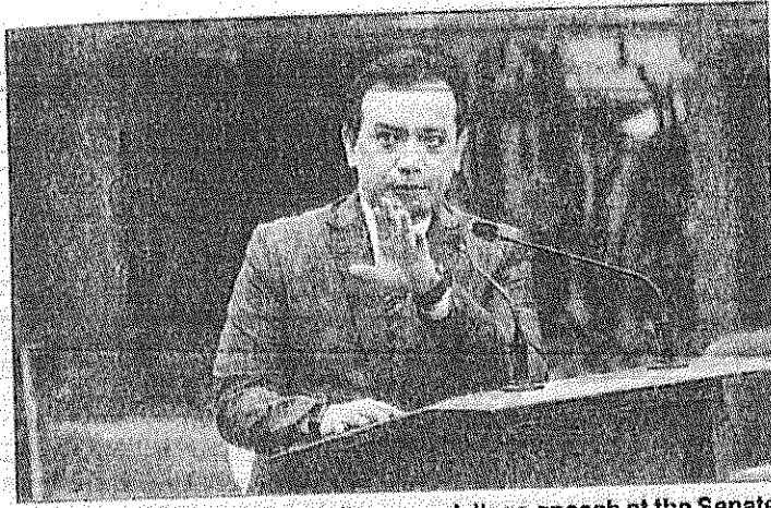
Sen. Antonio Trillanes IV delivers a privilege speech at the Senate to show Solicitor General Jose Calida's allegedly anomalous contracts as well as documents and videos of him applying for amnesty.