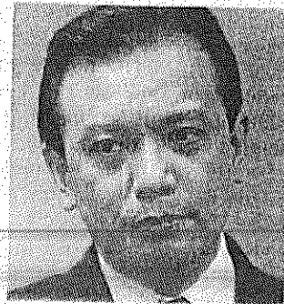
Sen. Antonio Trillanes IV

Last month, the President issued Proclamation No. 572, which voided Trillanes' amnesty and ordered his arrest.