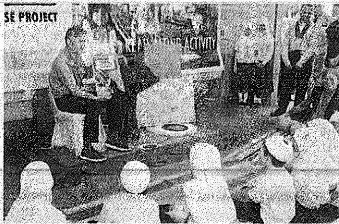
READ-ALONG US Ambassador Sung Kim tells a story to pupils of Amai Pakpak Elementary School at Barrio Green, Marawi City, during a read-along session on Tuesday.

The latest package brings the total USAID funding commitment to the rehabilitation of Marawi City to almost P3.2 billion ($59.1 million).